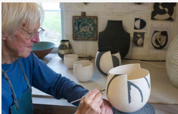
'Moon Bowl', 2015

Stoneware, alternating bands of black and white matt glazes with a 'moon' to either side, impressed JW mark