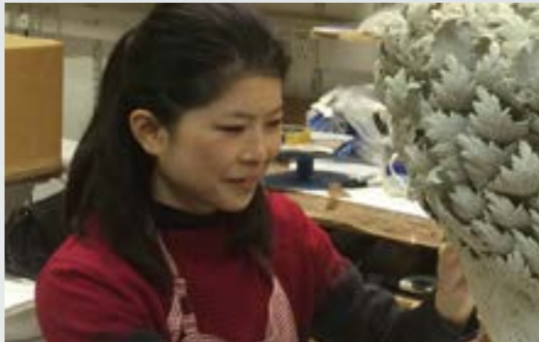
'Rose Bowl', 2015

Porcelain, unglazed moulded and carved foliate pieces, layered on an oval form