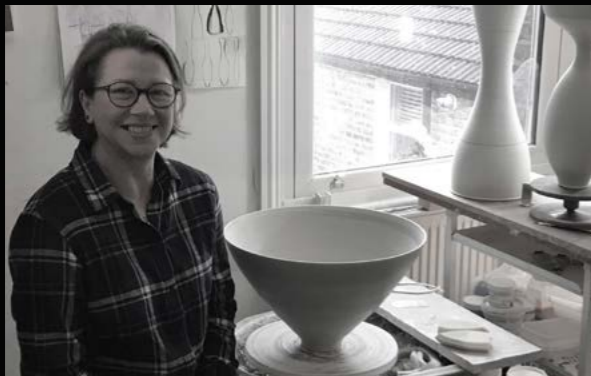
Vase Form, 2020

Porcelain, matt and satin white glaze, incised signature