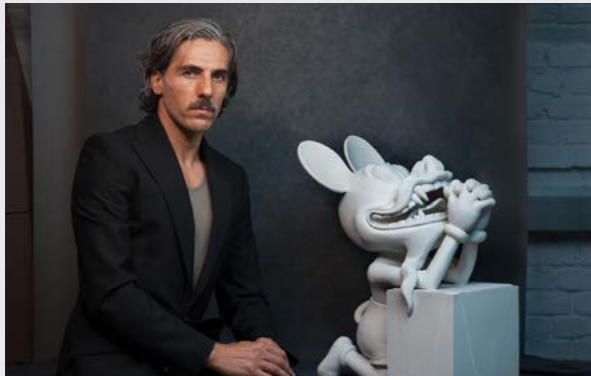
'Curiosity Killed the Cat', 2020 Stoneware, folded form in a honey glaze, initialled and dated