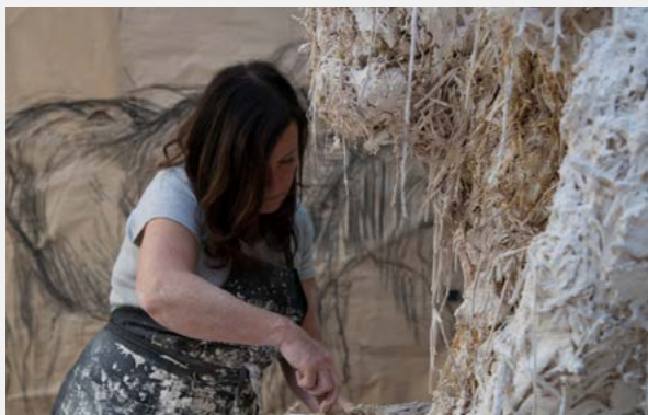
'Picasso's Owl' ,2020

Stoneware, dark lustrous grey glaze, signed in pencil