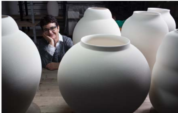
'Blue and White Vase', 2014

Porcelain, brushed blue glazes on a white ground