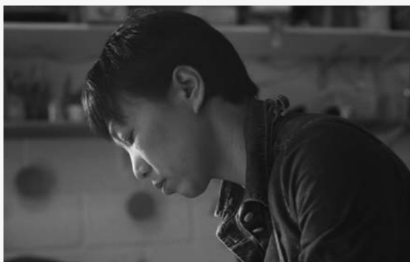
'Large Dry Kohiki Bowl', 2019

Stoneware, grey and white slips with blushed transparent glaze