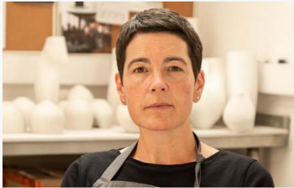
'Spine Camber Vessel', 2016

Porcelain, soft white glaze, pushed and manipulated thrown form, impressed maker's mark