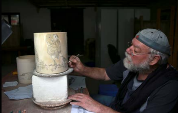
'Dancing Crabs', 2017

Porcelain, white Qinghua glaze with blue brush painting depicting crabs to either side, painted signature