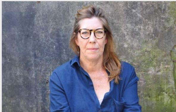
'Flower Jar', 2019 Stoneware, soda glaze in blues, pale greys and browns, incised maker's mark H 23.3cm, D 22.7cm