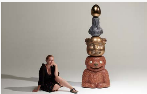
'Corn Dolly Mask #2', 2018

Earthenware, plaited corn form glazed in a shiny honey glaze