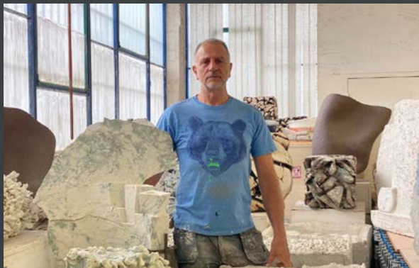
'Tectonic Plate', 2019

Stoneware and porcelain laminated with mixed industrial waste